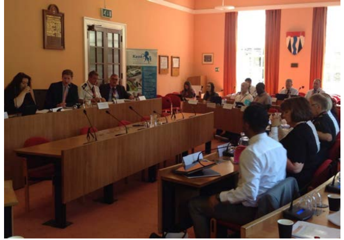
The Violence Reduction Unit meetings will build on the collaborative work seen at the PCC's Violence Reduction Challenge advisory panel

The PCC is keen to convene regular meetings whereby partners can get together again to discuss their ongoing work and agree actions going forward. By doing so, the PCC can ensure that the outcomes of the VRC do not sit gathering dust on a shelf, and that the VRC remains a working programme aiming to reduce the prevalence of violence committed against the most vulnerable across Kent.